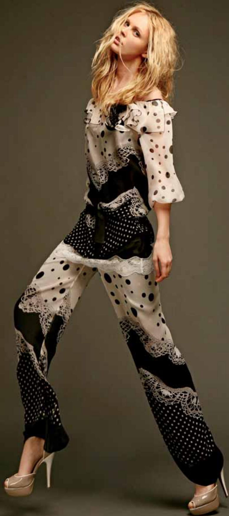
1033-14 blusa 1032-14 pantalone