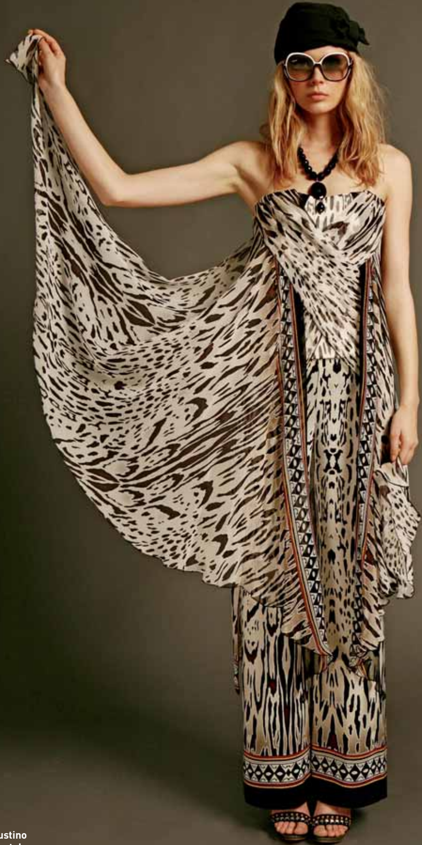
1042-14 bustino 1045-14 pantalone