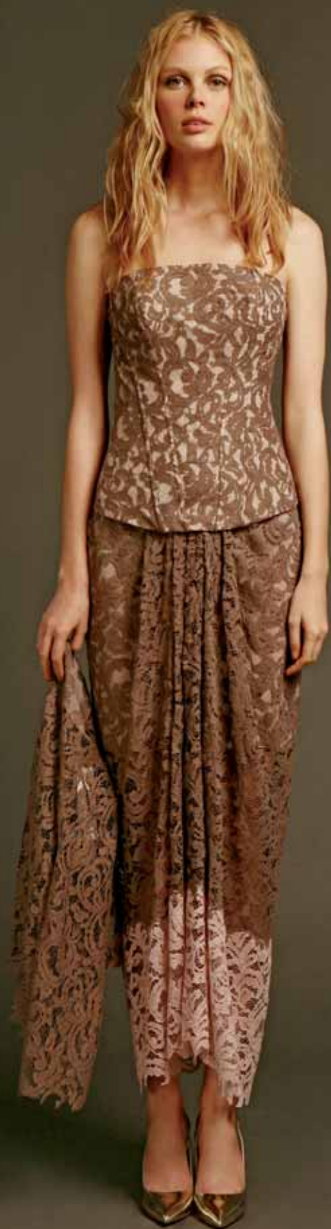
1092-14 bustino 1094-14 gonna 1095-14 bolero