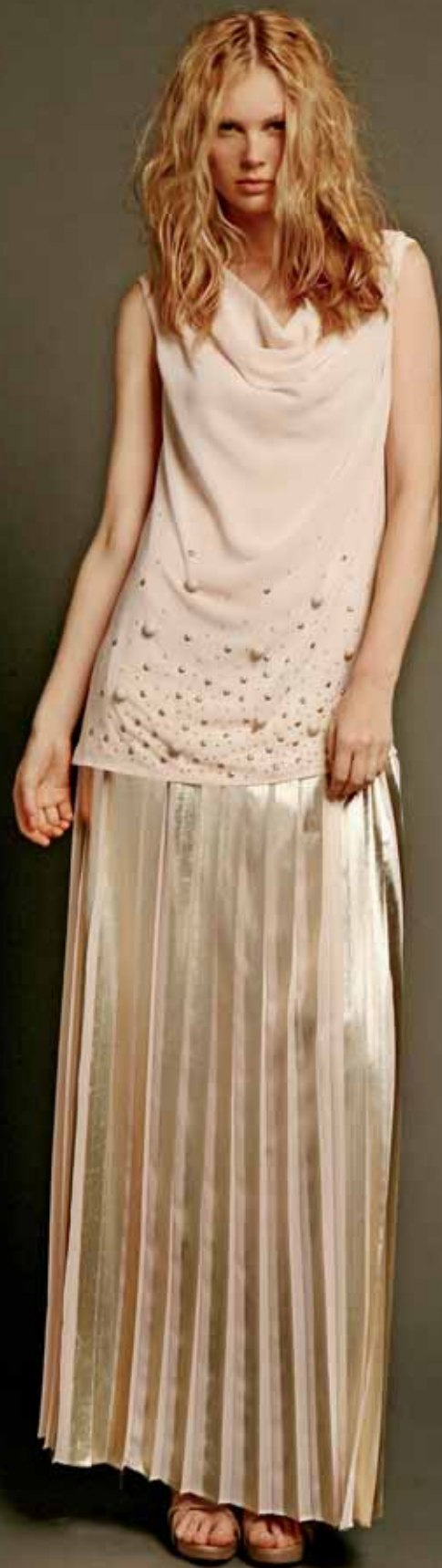
1078-14 maglia 1073-14 gonna