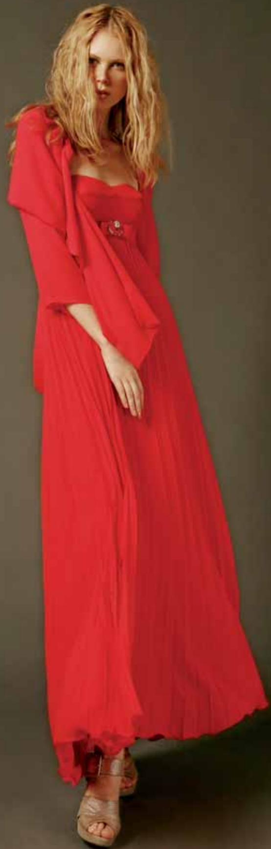
1005-14 abito 1003-14 stola