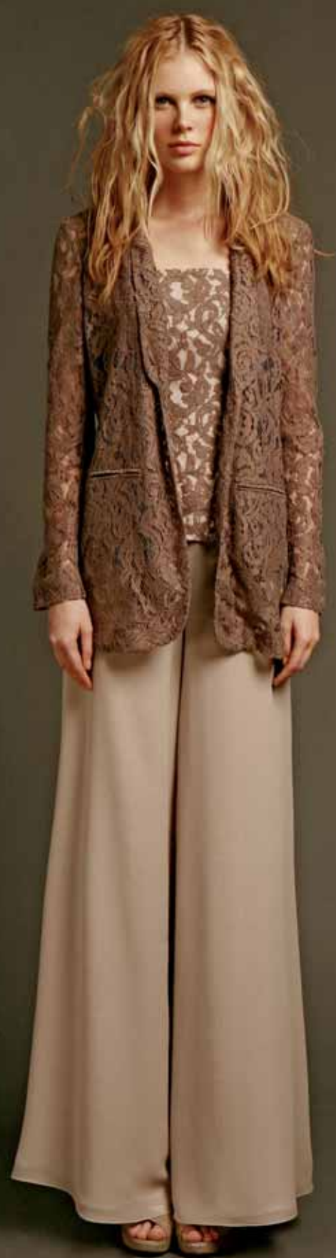
1090-14 giacca 1092-14 bustino